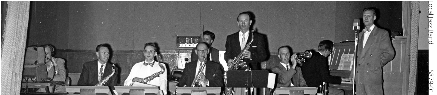
Local Jazz Band 5879-01