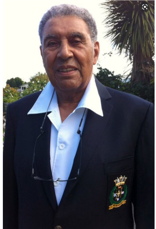
The Ambler - Northumberland, UK - February 4, 2013