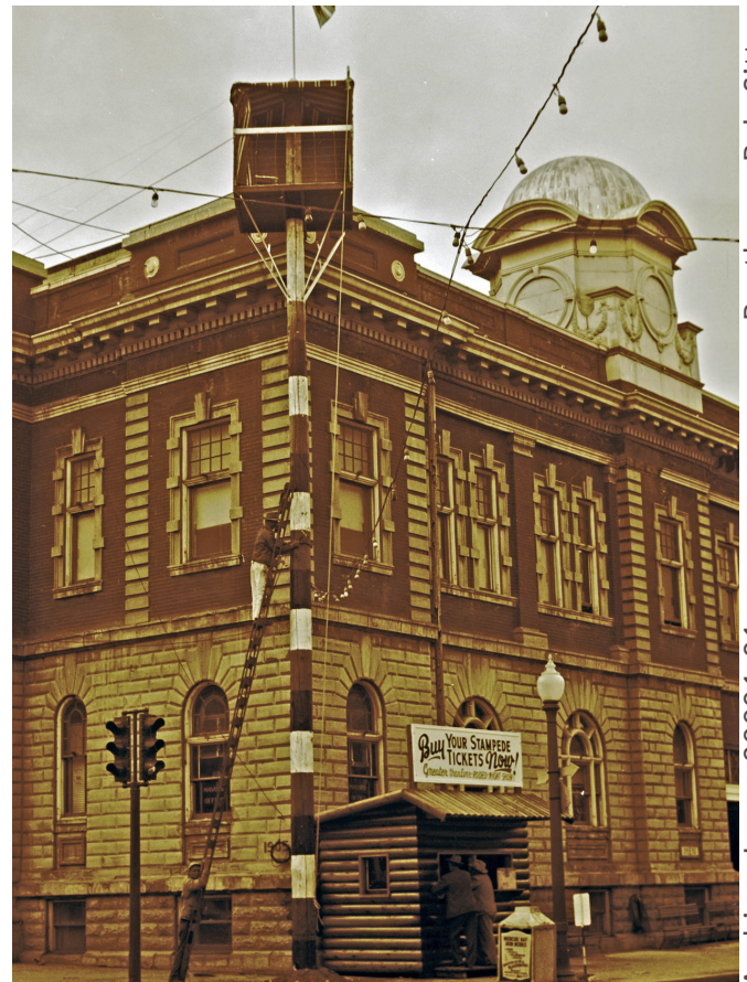
Penthouse Pole Sitter

On the street below, while the woman was making her thousands of phone calls high in the air, you could purchase your Stampede tickets at a small log structure. The images we have are from the 1950s, though perhaps it did continue into the 60s. Do you have any memories of the Pole Sitters? Did you receive a phone call inviting you to the Stampede? An interesting piece of history on high in Medicine Hat.