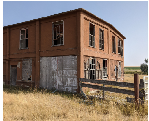
The Cement Factory at Dauntless, as it stands today.

Credit: Jenni Barrientos September 17, 2020