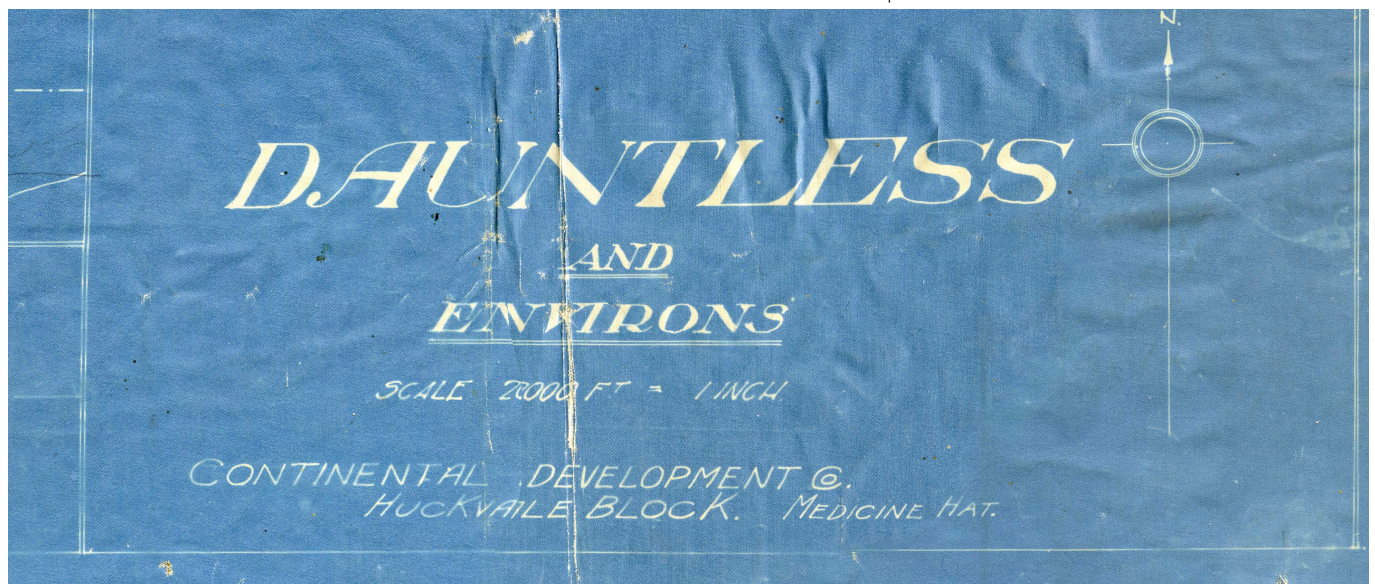
A selection of the map showing Dauntless and surrounding area. A full reproduction of the map will be available to view at the Program.

Credit: Jenni Barrientos September 17, 2020