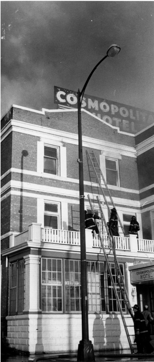
The Cos on fire, 1969.