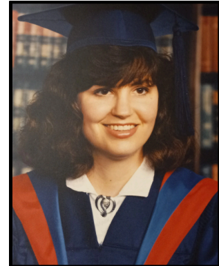
Alternatives Funeral Home