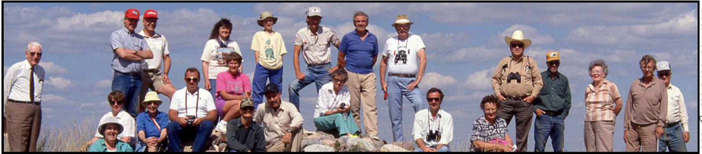
Visit to Blackfoot Crossing, 1990