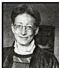
MH News, Aug 1994