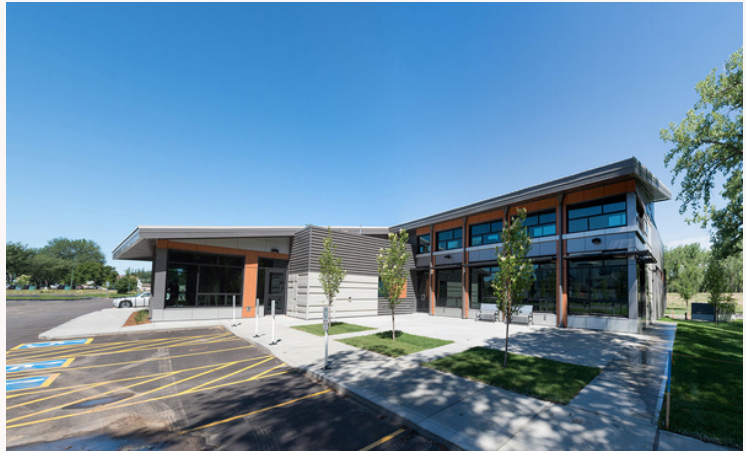
The Veiner Centre - Located at 225 Woodman Ave SE