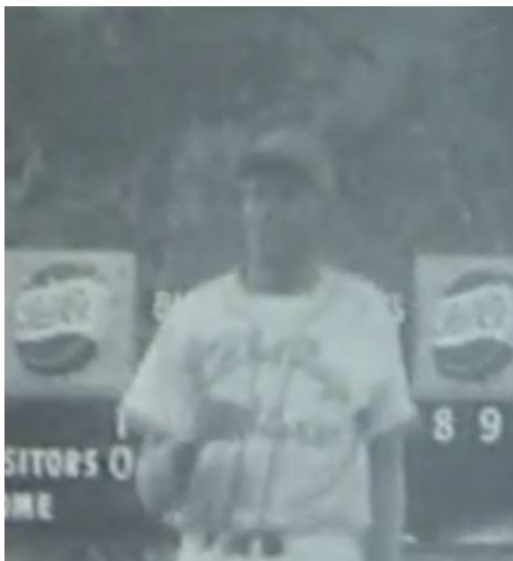
Some screen grabs from Satchel Paige's visit to Medicine Hat - Game recorded by CHAT TV Esplanade Accession No. 2015.08.201

In modern times, we are lucky to be able to watch preserved video and of Satchel Paige in action, right here in Medicine Hat. It's an amazing testament to how the game of baseball can still live on, even if you are forced to watch quite a lot of re-runs lately. Maybe you're interested in watching some archival footage of baseball games, or dig through some of those boxes of your own memorabilia at home. The excitement of baseball season can live on!