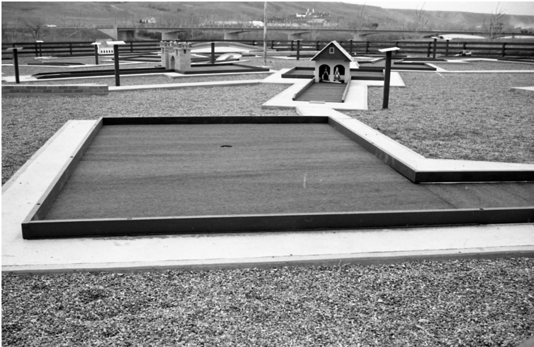
The Goofy Golf Course, with the TransCanada Highway Bridge in the background. ca. 1962

As well, Riverview Amusement Park hosted "open air dancing" two nights a week, with free admission, where you could dance and twist to the music of "The Renegades." The park also had their own eatery called the "Riverview Hamburger Stand", and was also the site of the CableVision Wearhouse (CableVision being a part of the Monarch TV Corporation).