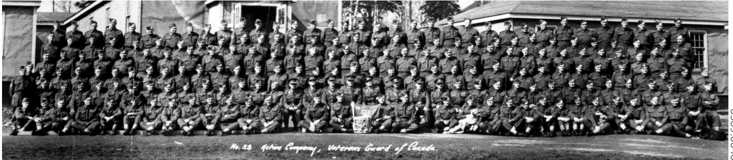
No. 28 Active Company, Veterans Guard of Canada.